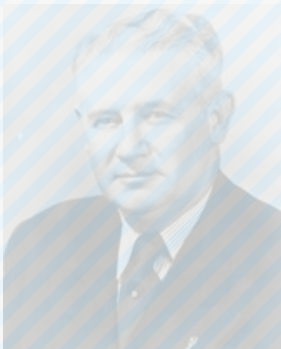
Lester C. Hunt