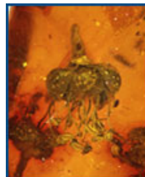
The Natural History Museum, London

Austin: Even though there is a mosquito now identified in Canadian amber as being from the time of the dinosaurs, I think our general lack of success in isolating ancient insect DNA from specimens preserved in amber makes the chances of isolating enough dinosaur DNA from the same source virtually nonexistent.