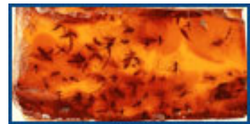
The Natural History Museum, London

DNA was first reported to have been recovered from amber in 1992 when scientists in California claimed to have extracted fragments of DNA from an extinct species of bee ( Proplebeia dominicana ) in Dominican amber. Shortly afterwards reports appeared of DNA from an extinct species of termite ( Mastotermes electrodominicus ), also in Dominican amber, by scientists in New York. This was followed by reports of DNA extraction from a beetle in Lebanese amber. However, only small bits of the DNA string were recovered. There has been some scepticism as to whether these claims are genuine or the result of contamination. Experiments on the survival rate of DNA have shown that it breaks down very quickly, particularly in the presence of water. However, the insects in amber are dehydrated and if this happened quickly then it could possibly halt the decay of the DNA.