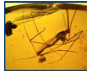
The Natural History Museum, London Mosquito in Dominican amber.

Even after an insect is trapped in resin, bacteria and enzymes continue working in the gut, rotting the insect from the inside. Indeed, many insects preserved in amber, particularly Baltic, are completely hollow without any internal tissue preserved. If it is so difficult to get DNA from an insect in amber, then the chances of getting any DNA from something it fed on are even more remote. If it were possible to extract DNA from a blood meal in an amber insect, only tiny amounts of the entire DNA string (genome) would be recovered and it would probably be contaminated with bacterial and insect DNA. Key parts of the genome would be required to work out which type of animal the blood came from. Biologists could only guess at what was missing from the complete DNA string, without knowing for sure. Although scientists can manipulate and make copies of DNA, they can't make it grow into an animal.