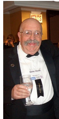
Wolfe dum Nebula Awards semajfino en Ĉikago, aprilo 2005 (2004 "kandidato")