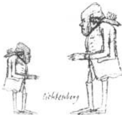
Figure 2 Lichtenberg (sketch, probably from the 1790s, private collection).

If astuteness is represented by a magnifying lens then wit is by a reducing lens. To look into the telescope at the wrong end. 3