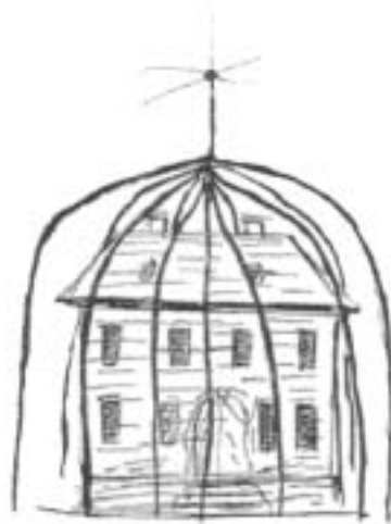
Figure 3 A Faraday-Cage, proposed by Lichtenberg.

asked as an expert what the best way was to prevent being struck by lightning he described a Faraday cage embracing the whole building and continued: