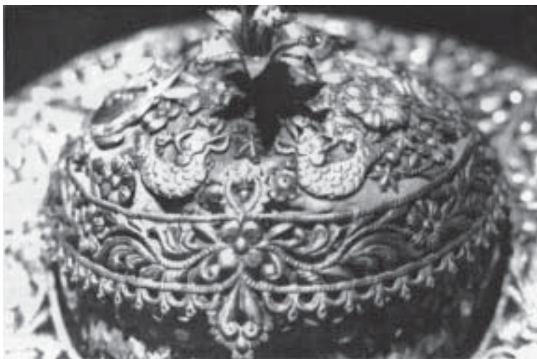
Fig. 3: Silver bishop's hat (probably from Cuzco) with sirens playing guitars. Brooklyn Museum, New York.