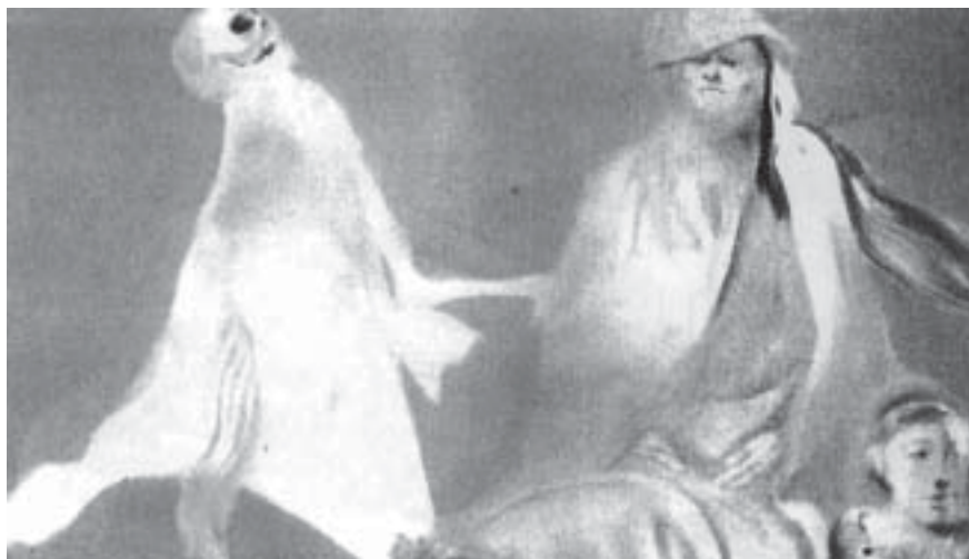
Fig. 4: Rafael Coronel. La muerte de la libélula (Death of the Dragonfly). 60 x 180 cm. Museo de Arte Moderno, Mexico City.