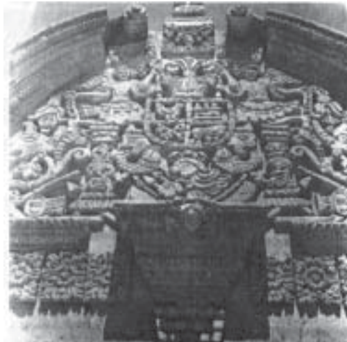
Fig. 2: The façade of the Casa del Moral, Arequipa, Peru.