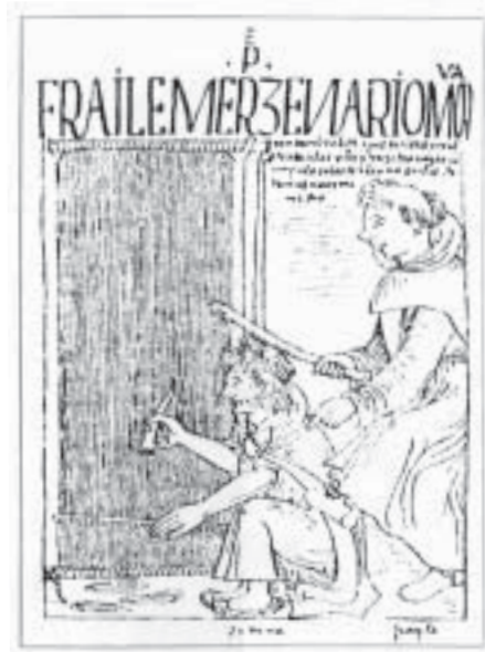
Fig. 1. Mercenary friar (sic) mistreating an Indian weaver. In Primer nueva corónica y buen gobierno , Felipe Guamán Poma de Ayala (1612).