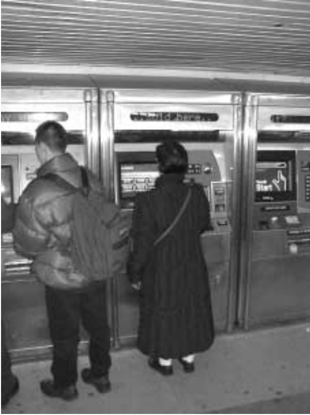
New York City Transit's MetroCard vending machines allow customers to purchase a wide variety of fares and passes using cash, credit, or debit cards.

bus and subway. For many passengers, it represented a 50% discount on what they had formerly paid, and it probably explains why bus usage has risen even more than subway usage. Transfers within the subway system (among lines) have been free for decades, but the MetroCard essentially made free any bus rides to access subway stations. Moreover, for the first time, monthly, weekly and daily passes were introduced in 1998, allowing unlimited travel for frequent travelers. By 2000, 67% of all riders used some form of discounted MetroCard. NYCT estimates that the various discounts reduced the average fare by 22% from 1997 to 2000.