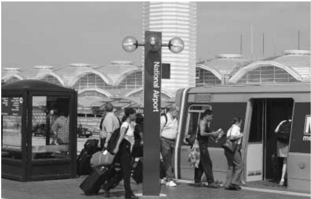
Ridership on the Washington, D.C. Metro has soared over the past decade, making it the second largest heavy rail system in the country, second only to New York and with 50% more passengers than Chicago's system. The D.C. Metro was one of the first to provide direct rail access to its airport, Reagan Washington National. Many other systems have followed, so that nine American cities now have rail connections to their airports.

Thus, American public transit's dramatic turnaround at mid-decade was largely due to burgeoning public transport use in New York, which is discussed in detail later in this article. But it was also due to an economic boom in all sections of the country, leading to record low unemployment rates, soaring worktrip demand, increased travel for other purposes as well, and rapidly worsening roadway congestion. As shown in Table 3, total U.S. employment rose by 15 million jobs from 1995 to 2000, about twice as fast as the growth in the first half of the decade. Moreover, the unemployment rate fell to only 4% in 2000. That reversal was even more dramatic in the New York region. Between 1995 and 2000, the unemployment