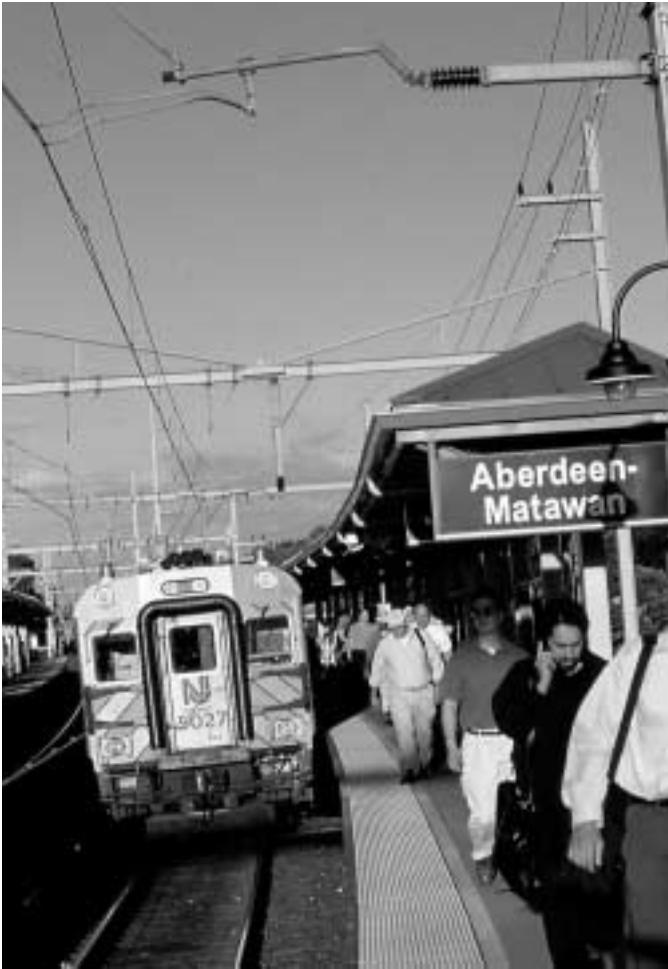
New Jersey Transit has rebuilt a third of its 150 suburban rail stations to provide easier boarding, waiting rooms, and extensive park and ride facilities.

cles, including 1,400 new buses, 200 new single-level rail coaches, and 70 rehabilitated rail coaches in the next two years alone. New double-decker rail cars will be introduced on NJT's congested Northeast Corridor Line from Trenton to Manhattan by 2004 or 2005.